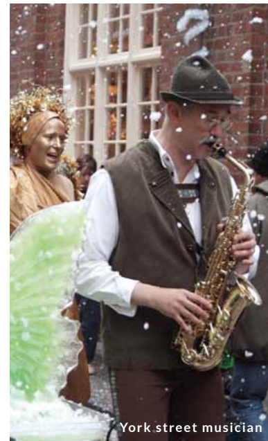
York street musician

At EiY we offer you the opportunity to continue learning English outside the classroom. By joining our exclusive social programme, you can practise English with other language learners. Our programme includes day trips to other cities, to the coast, to the beautiful countryside as well as a range of fun evening activities such as cinema, bowling, salsa, football and theatre.