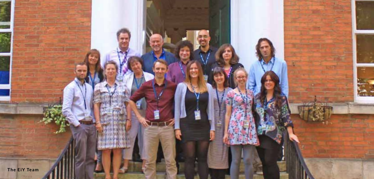
The EiY Team