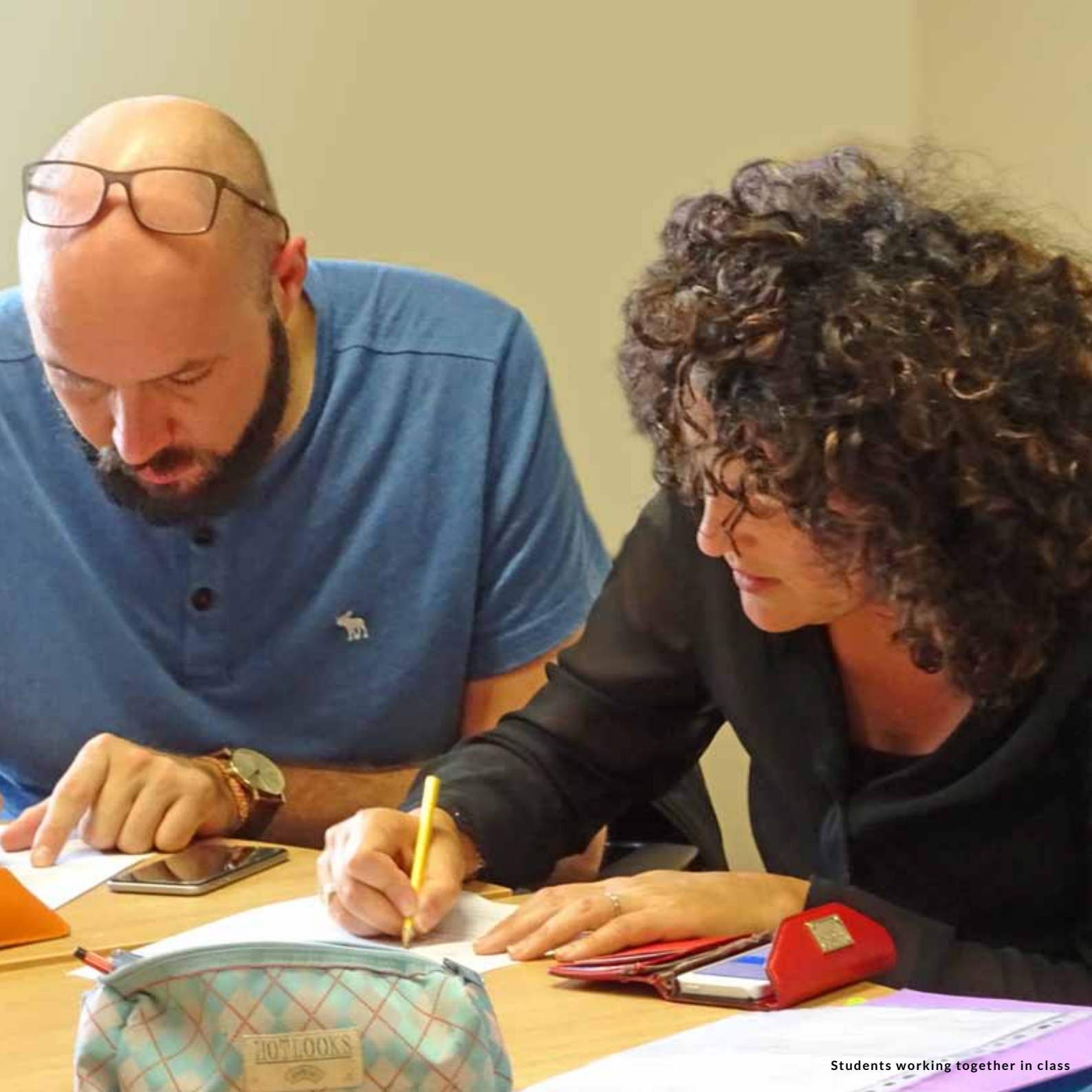
Students working together in class