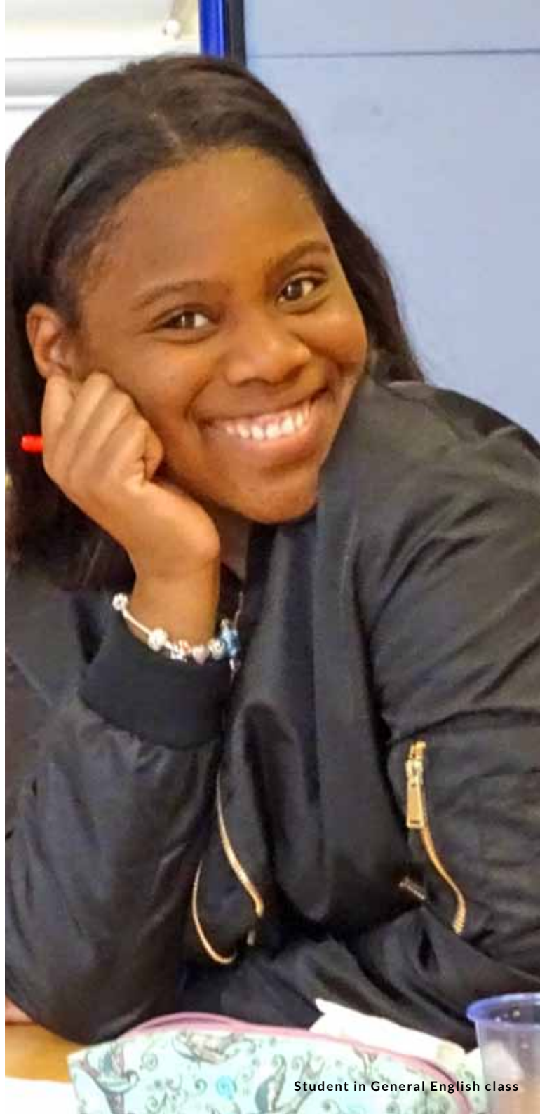
Student in General English class

CEFR refers to the Common European Framework of Reference for Languages