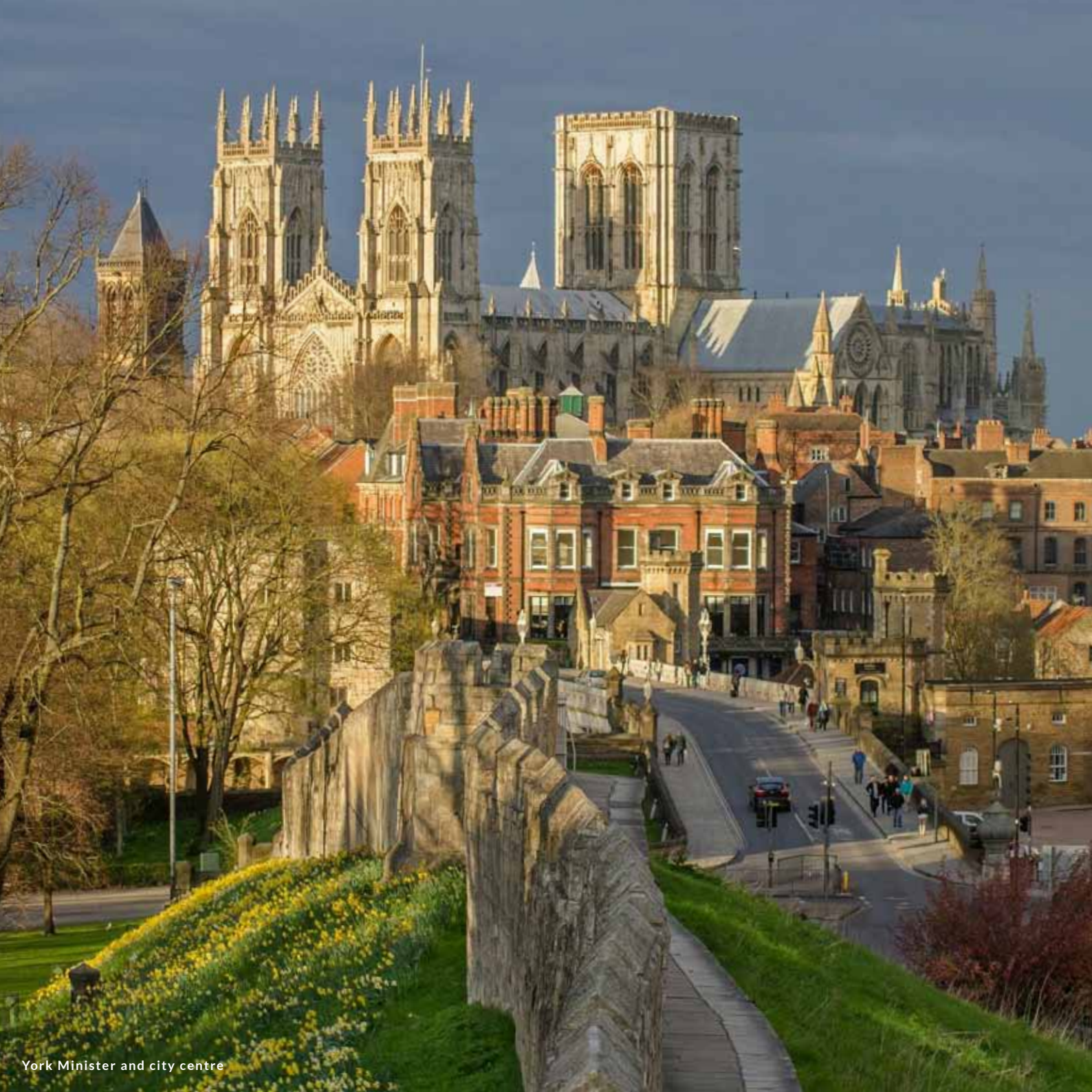
York Minster and city centre