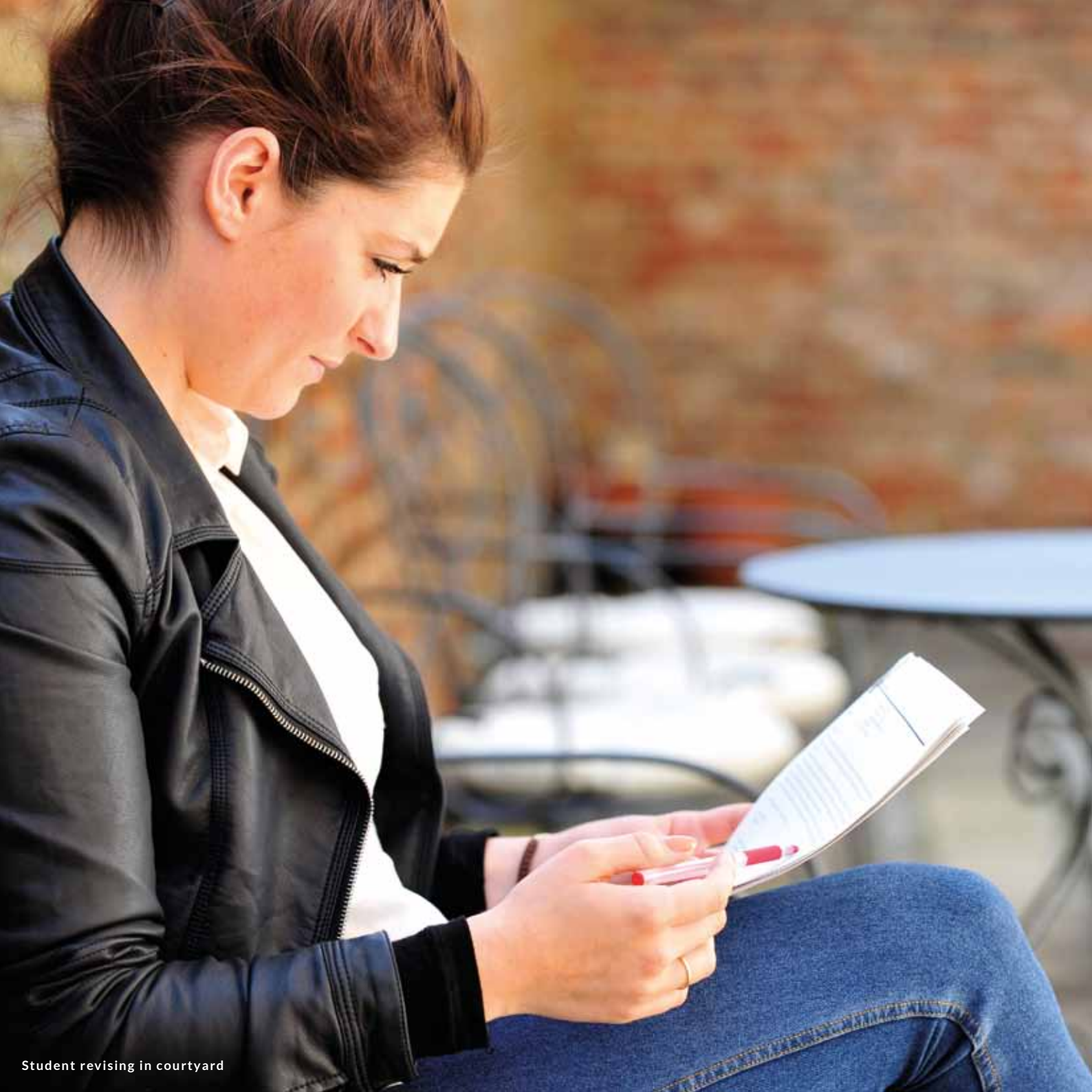
Student revising in courtyard