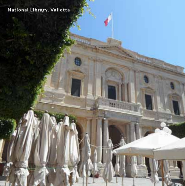
National Library, Valletta