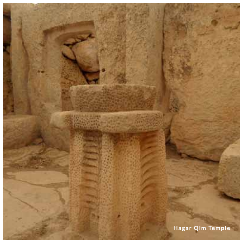
Hagar Qim Temple