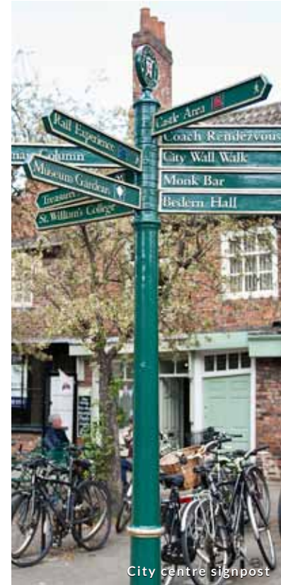
City centre signpost

York is very well connected to many major cities. For example, you can easily reach central London (King's Cross Station) by train in just 2 hours while Edinburgh is 2.5 hours away. If you want to venture further afield, you could make it to Paris by Eurostar from London in just over 2 hours.