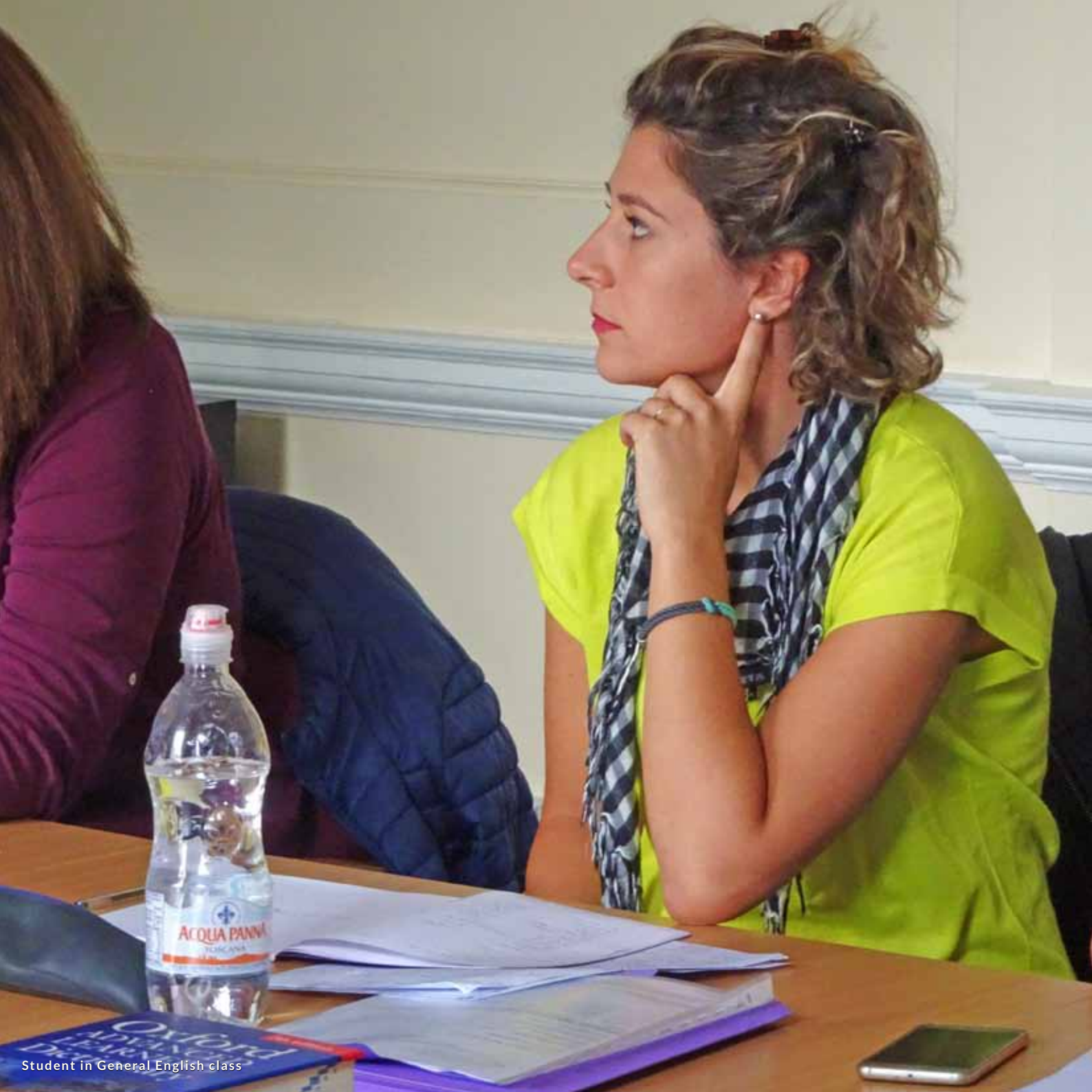
Student in General English class