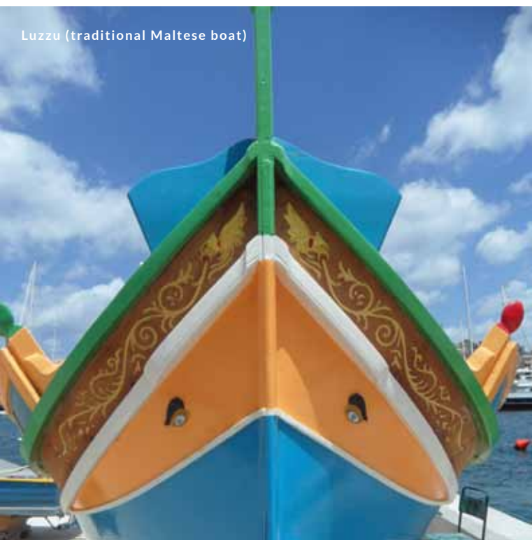
Luzzu (traditional Maltese boat)