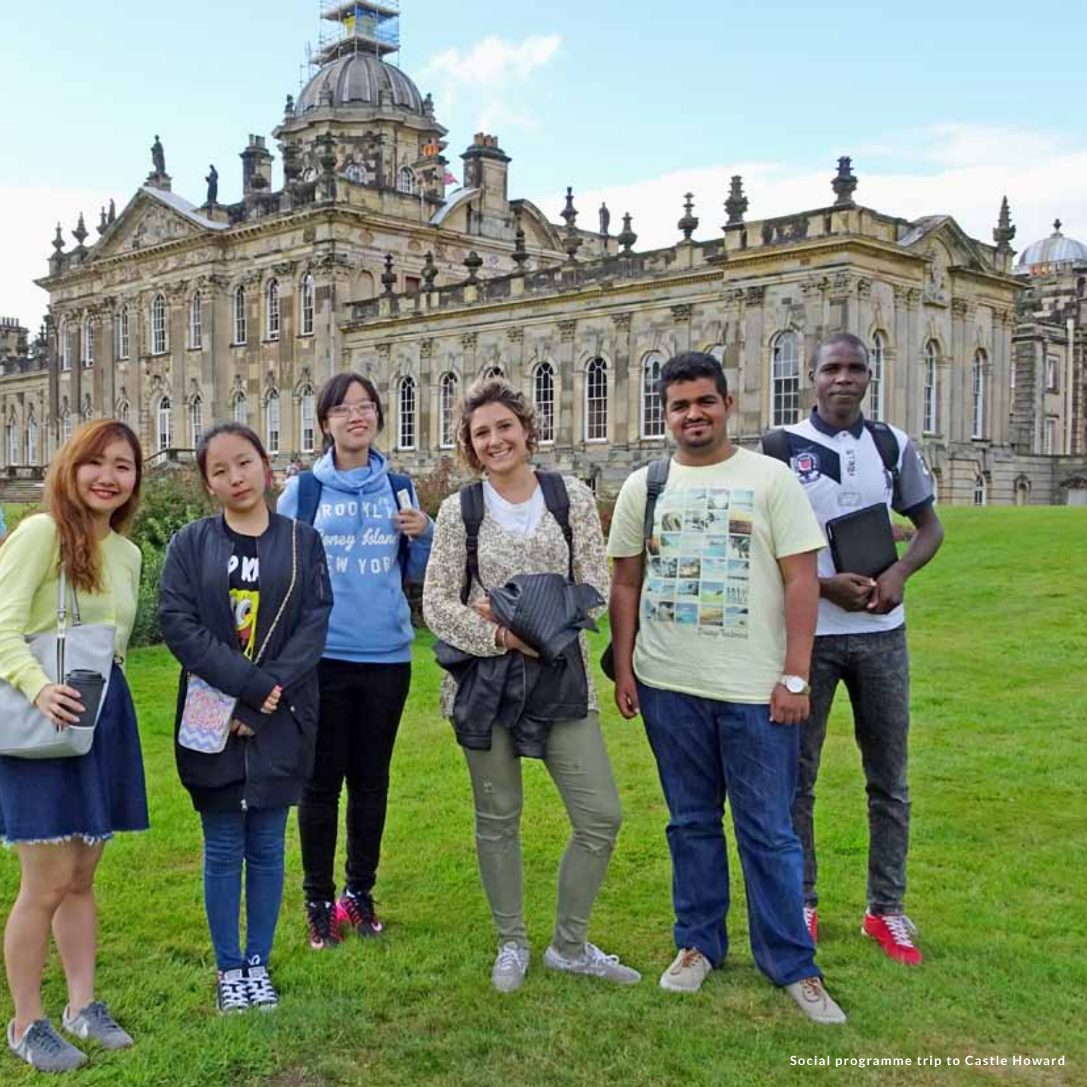
Social programme trip to Castle Howard